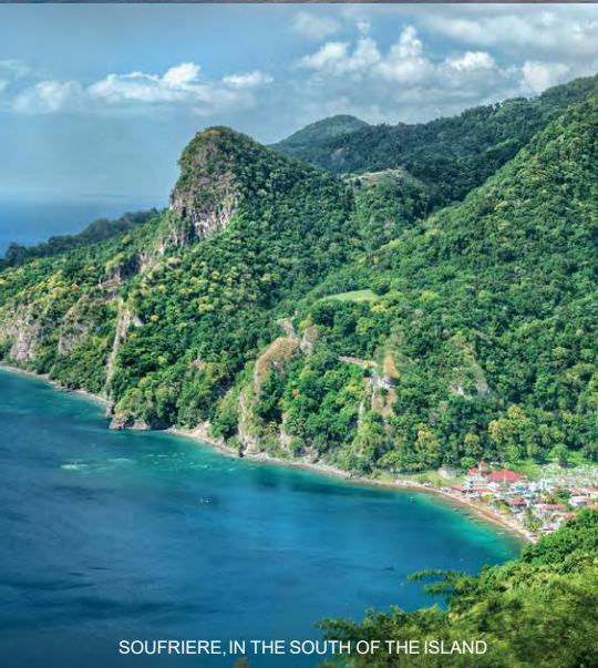
SOUFRIERE, IN THE SOUTH OF THE ISLAND